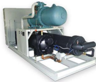
Water Cooled Compact Chiller