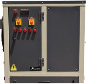
RO Water Chiller