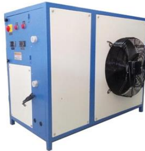
Industrial Water Chiller