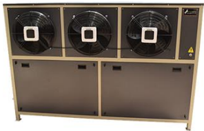
Air Cooled Compact Chiller