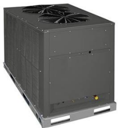
Commercial Air Conditioner and Condenser