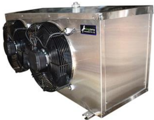
Fruit Ripening Plant