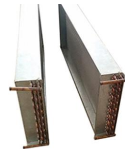
Chilled Water Cooling Coil