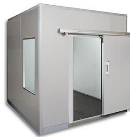
Cold Room/ Storage